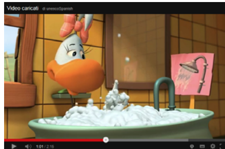
© Proyecto H2Ooooh! - Héroes ahorradores de agua

UNESCO TV Spanish airs H2Ooooh! video 'Heroes of water saving': Héroes ahorradores de agua