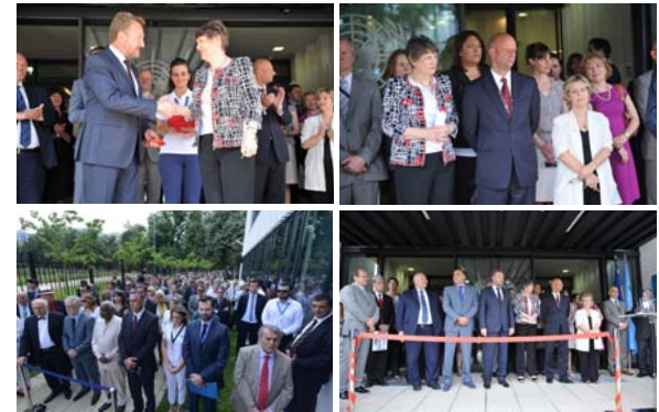
Opening ceremony of the UN House

In addition to the opening ceremony of the UN House and the signing of the Declaration, during her three-day visit to Bosnia and Herzegovina Helen Clark met with Bakir Izetbegović, Member of the BiH Presidency, Zlatko Lagumdžija, BiH Minister of Foreign Affairs, Milorad Dodik, President of Republika Srpska, Željka Cvijanović, Prime Minister of Republika Srpska, Nermin Nikšić, Prime Minister of the Federation of BiH, Peter Sorensen, Head of the EU Delegation to BiH and Special Representative of EU and other senior officials and diplomats in