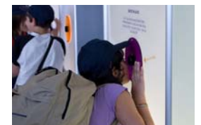
©Gabriele Nosio - exhibition at the Science Centre of the City of Science