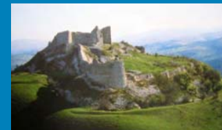
▲ - Novo Brdo Castle

Following through on commitments made at its first international conference to “Safeguard the cultural heritage in Kosovo[1]” in 2005, UNESCO is zooming in on the antique settlement of Novo Brdo/ Novobërdë in cooperation with and funding from the European Union.