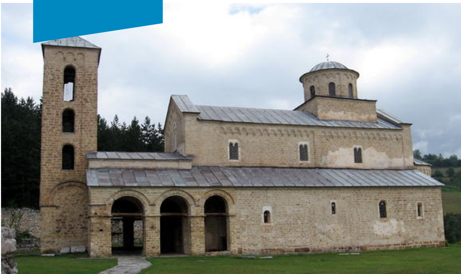
◀ Lumen roma - Stari Ras and Sopoćani