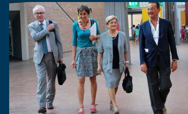
UNESCO Club of Rome delivers its contribution

through a multi-purpose facility located in Naples, consisting of an interactive science museum, a business incubator and a training center. >>full story