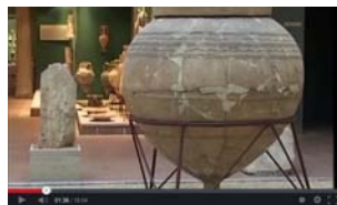
© UNESCO - Fighting illicit traffic of cultural property in South-East Europe