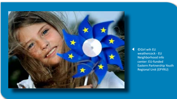
© Girl with EU weathercock - EU Neighborhood Info center; EU-funded Eastern Partnership Youth Regional Unit (EPYRU)

At the heart of this joint endeavour lies a shared commitment to fundamental values, such as democracy, the rule of law, respect for human rights and fundamental freedoms. >>full story