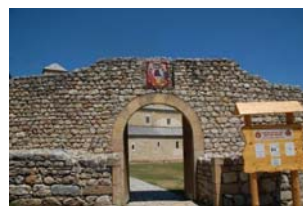
▲ © Natasha Lazic - Stari Ras and Sopoćani

Accordingly, the establishment of a broad and inclusive participatory approach seems to be the top priority for the definition of a shared and high-quality planning document, as well as for its future implementation. >>>full story