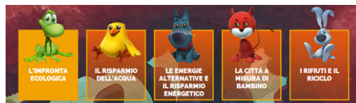
© I bambini di OVS salvano il mondo

Website: http://ibambinidi-ovsalvanoilmondo.ovs.it/