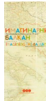
© Imagining the Balkans - Exhibit Poster

The exhibit "Imagining the Balkans. Identities and Memory in the long 19th century", coordinated by the UNESCO Regional Bureau for Science and Culture in Europe, Venice (Italy), with the support and participation of the International Council of Museums (ICOM), was inaugurated at the Historical Museum of Serbia, on 9 September 2013, in the presence of Bratislav Petković, Minister of Culture and Media, Serbia.