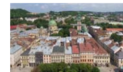
▲ Old town in Lviv (Ukraine)

policies that help create an enabling environment in which these sectors can operate and grow, and policies which ensure a broad access to diverse cultural goods and services such as intellectual property rights, information society/digitization, taxation, social affairs, local and regional development, international relations and cooperation, international trade. >>>full story