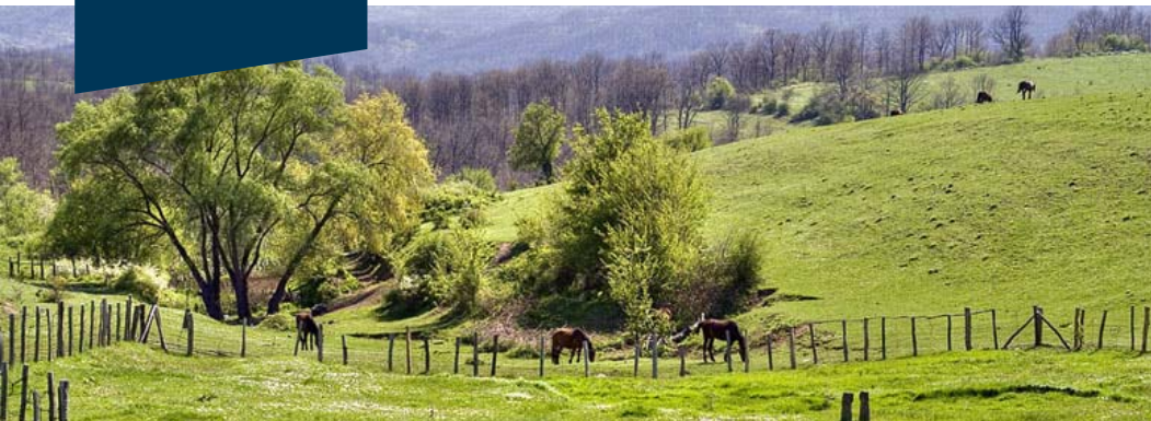
▲ © Evgeni Dinev – Landscape from the Strandzha Mountains, Bulgaria