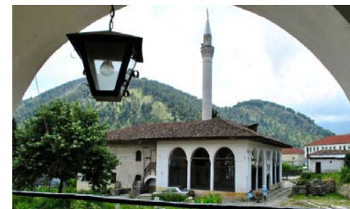
◀ King's Mosque

The Regional Centre for the Restoration of Monuments based in Tirana, Albania, and the Turkish International Cooperation and Development Agency (TIKA), in cooperation with the UNESCO Regional Bureau for Science and Culture in Europe, Venice (Italy), are launching this first regional training workshop. Of a duration of 2 weeks, the event will take place in Tirana and Berat from 21 October to 2 November 2013.