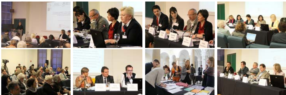
Photos of the event