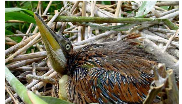
▲ Mura-Drava-Danube Transboundary Biosphere Reserve

Within the 2013 EuroMAB Network Meeting in Frontenac Arch Biosphere, Canada, the UNESCO Regional Bureau for Science and Culture in Europe, Venice (Italy), will hold a workshop on Transboundary Biosphere Reserves on 17 October 2013 with the aim to enhance the capacity of EuroMAB countries to establish and manage their biosphere reserves, particularly transboundary ones, and to look at the transboundary potential within the EuroMAB network through innovative approaches to conservation and sustainable development.