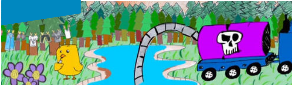
© Gruppo Alcini/Ciak Junior - Water belongs to us all!