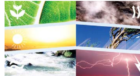
© REENFOR2013 - Permanent International Forum on Renewable Energy

The first international forum on Renewable Energy REENFOR-2013 will take place from 22-23 October 2013 in Moscow at the initiative of the Russian Academy of Sciences and the Non-Profit Partnership "Scientific-Technical Council of the Unified Energy System".