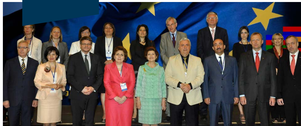
Family Photo

The Partnership will also promote democracy and good governance, strengthen energy security, promote sector reform and environment protection, encourage people to people contacts, support economic and social development and offer additional funding for projects to reduce socio-economic imbalances and increase stability.