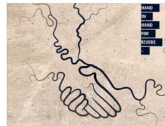
© SEE River Project - Brochure

The UNESCO Regional Bureau for Science and Culture in Europe, Venice (Italy), is affiliated to the project as an observer partner. >>full story